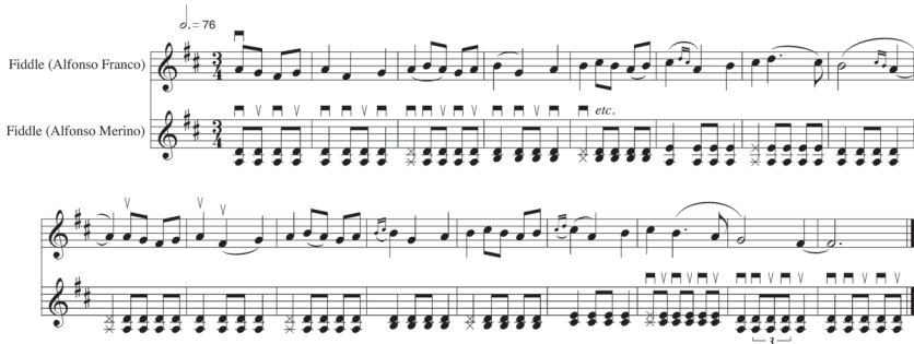
Figure 5. Alfonso Franco and Alfonso Merino play the first part of “Xota de Monforte” with an accompanying chopping pattern.

Position-taking occurs within genres as well. Within a given North Atlantic fiddling tradition, certain repertoire, playing styles, arrangement techniques, ensembles, and presentation styles are marked as “traditional” while others are marked as “contemporary” or “modern,” and musicians may choose to present themselves as more traditional on certain occasions and as more contemporary on others. In such a context, the chop may serve as a marker of modernity. Bands that market themselves as traditional don’t chop; those bands that do chop describe